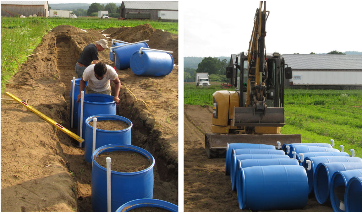
Figure 3. Installation of lysimeters to measure pharmaceutical and biological concentrations in soil leachate.

Twenty tank lysimeters buried along one edge of the test plot are used to monitor concentrations of pharmaceuticals and plant nutrients in water leaching through the top 60 cm of soil. Each lysimeter consists of a polyethylene tank equipped with a bottom drain that is connected to a vertical standpipe, through which accumulated water can be removed using a suction wand. The soil column within the lysimeter rests on a rigid permeable floor supported 15 cm above the bottom of each lysimeter, leaving an open reservoir area below the soil column in which leachate can accumulate between sampling events. Standpipes are capped to prevent air exchange between the atmosphere and the reservoir area. To install the lysimeters, a trench was excavated and soil stored in piles corresponding to visually distinct soil layers, the density and depth of which were determined at the time of excavation. The lysimeters were then placed in the trench and packed with soil to recreate the depth and density of the original layers. Water is removed from the lysimeters and sent to Michigan and Buffalo for analysis whenever a sufficient amount accumulates for sampling.