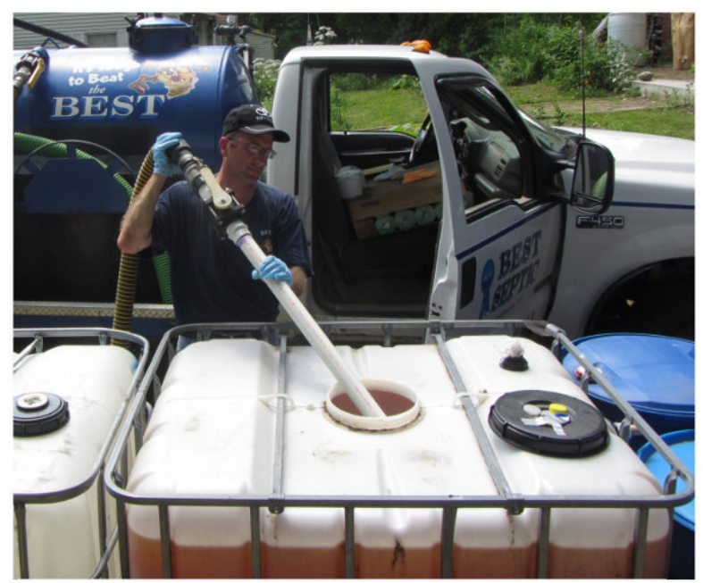
Figure 1. Pumping urine from the collection depot using a vaccuum truck for transport to a participating farm.

A local septage hauling company, Best Septic Services of Westminster, provides urine transport for the project. Their innovative work developing methods for the practical and economical transport of urine using standard industry equipment was featured in Pumper Magazine (Wysocky, 2015). One of the company's portable toilet service trucks is now configured with a dedicated tank compartment for urine, allowing the driver to make urine collections while traveling the company's existing portable toilet service route. The company's urine transport fee of $0.10/gallon is lower than their standard rate for transporting septage to a treatment facility because there is no tipping fee at the participating farms, which accept the urine free of charge due to its fertilizer value.