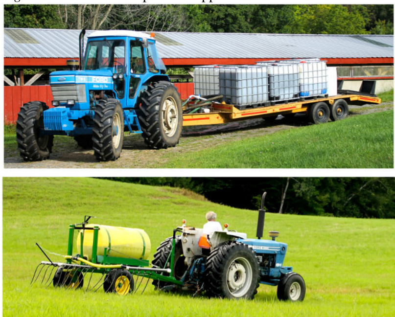
Figure 4. On-farm transport and application of sanitized urine.

All urine used in the 2014 season was treated through the long-term storage method (>30 days at or above 20°C) in purpose-built, unheated greenhouses made of clear plastic film stretched over wooden frames. Electronic temperature sensors were submerged in the tanks and connected to a datalogger which recorded time-stamped temperature readings for periodic retrieval.